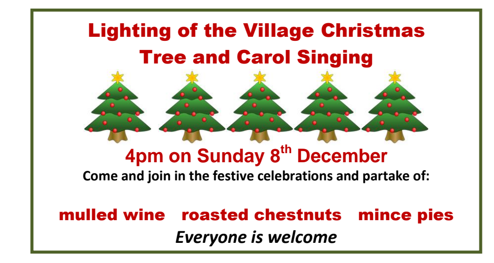
Note: Helpers are welcomed to assist with the preparation of the tree and its decoration on Saturday the 7<sup>th</sup> December. Please contact Graeme Barker or Kevin McCormick if you are able to help