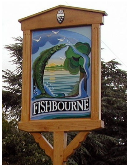
OPTION 1 DECORATED TIMBER CARVING