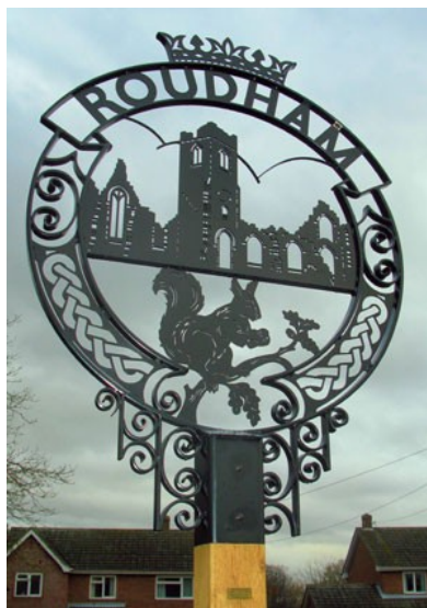
OPTION 2 LASER CUT STEEL /CAST IRON