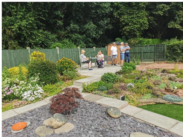
Kath Kay's garden Parkland Close

Of course, paying for speakers becomes more expensive year on year, which is why we have a garden trail in the village where we are able to visit some really lovely gardens, one by one with refreshments at the first and last gardens, which also raises much needed funds. (see photos)